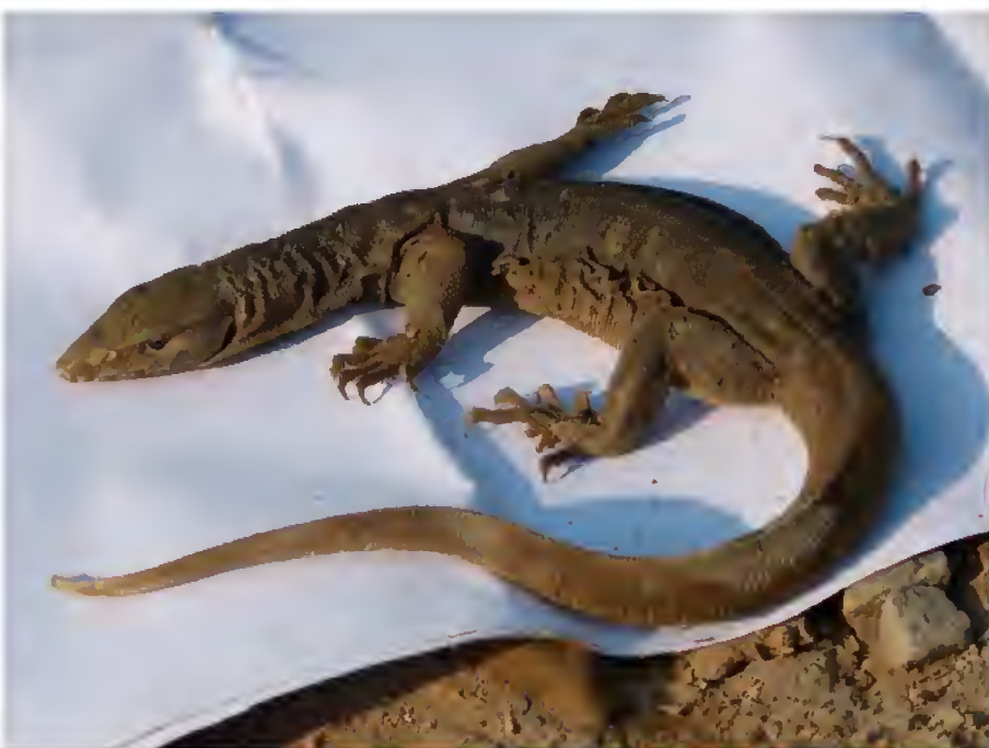
Fig. 2K. Bengal Monitor Varanus bengalensis .